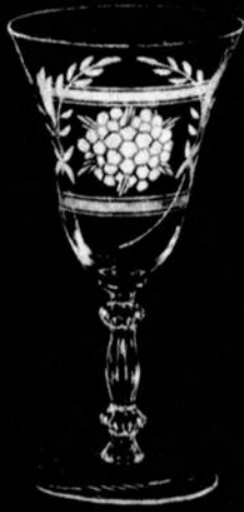
3130 Winthrop (983)