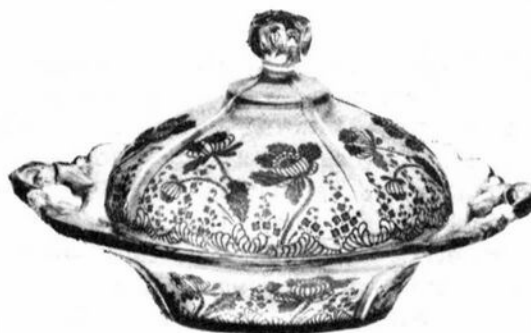
#3400/52 5½" BUTTER & COVER Plate Etched #746 "Gloria"

Possibly the best known Cambridge butter dish is the #3400/52. First seen in 1930 as a part of the #3400 Line, this butter was described by Cambridge as a 5 1/2" Butter and Cover. The #3400/52 butter dish was to remain in the Cambridge line for the next twenty-four years, only to be discontinued with the initial plant closing in 1954.