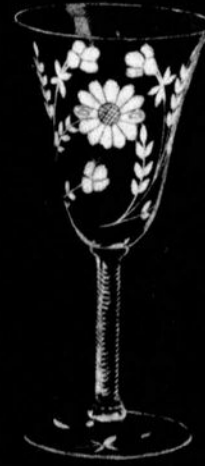
3151 Cosmos (986)