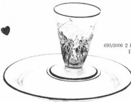
693/3000 2 Pc. Canape Set D/983

FOR SALE: Caprice blue 10 oz. Tumblers (8) $26; #851 amber Ice Bucket $26; Caprice #76 epergne w/prisms $76; green Georgian Sundae $8; #1066 etched, green w/crystal stem 12 oz. ftd. Tumblers (5) $12; 7 oz. tall sherbets (7) $10; 5 oz. ftd. Tumblers (7) $9. Azurite #62 tall Comport $38; amber #3400/38 80 oz. Ball Jug $48; same 12 oz. Tumblers (4) $8; Star #1016 9 oz. Goblet (2) $9; same Salad Plates (2) $6; #3143/39 crystal Gyro Optic 86 oz. Pitcher w/13 oz. Tumblers (6) Set $65 #103 Mt. Vernon dark green Relish $25; #3400/9 yellow Candy box w/lid $47; green Farberware Basket 5" $22. Priced Each. Postage Extra. A & D Antiques , 10410 Dent Rd., New Concord, OH 43762. 614/796-2872.