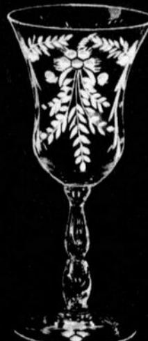
3600 Minuet (990)