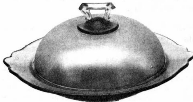
#920 BUTTER & COVER with DRAINER

the bottom and cover, there is a liner on which the butter actually sits. No information regarding the use of this butter as a blank for etched lines during the 1920s is provided in this catalog nor does the 1930 catalog provide such data even though it again is shown plain. Without a doubt, on this butter dish will be found such 1920s and 1930s etchings as #704, #731, #732, and #520.