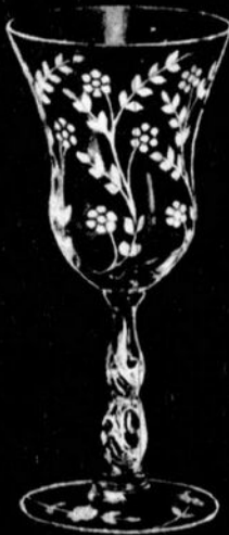
3600 Petite (988)