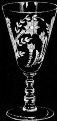
3139 Sicily (984)