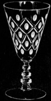
3139 Regent (992)