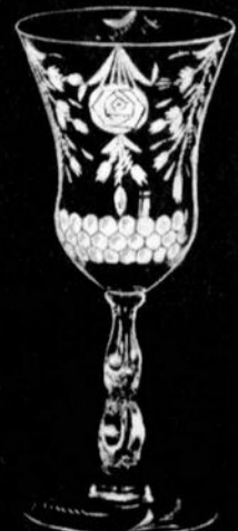
3600 Rose Marie (991)