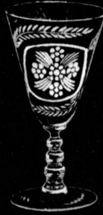
3139 Aristocrat (937)