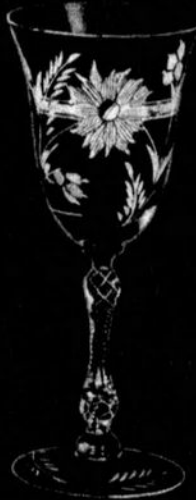
3116 Maryland (985)