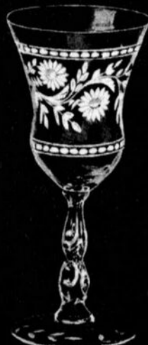
3600 Marquis (989)