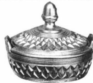
MOUNT VERNON #73 5" BUTTER TUB & COVER

"MOUNT VERNON. This Early American pattern is a brilliant Crystal line by Cambridge. Inspired by worthy tradition and executed with true craftsmanship, it lends itself very naturally to the Early American dining room ensemble. Just a few items of the line are shown. Other items are footed tumbler, sugar and cream, bread and butter, fruit saucer, candy jar, footed bonbons, fancy comports, vases and bowls."