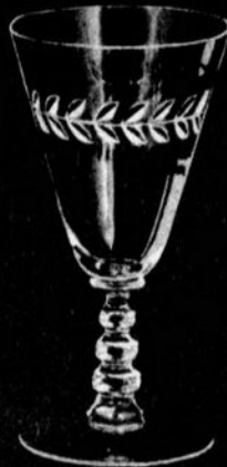
3139 Laurel Wreath