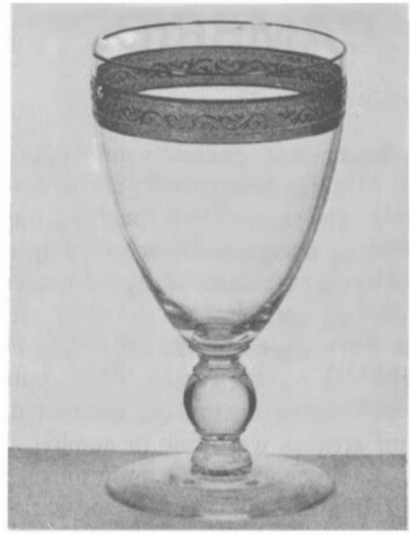
THE CAMBRIDGE GLASS COMPANY. Scheduled for introduction at summer markets is "Helene," clear crystal encrusted with a wide platinum band. Stemware items retail for approximately $3 each.

Until recently, the only evidence that No. 1067 stemware was produced during the reopened years, was its inclusion in the special order replacement service offered during 1956. It has now been learned, through discovery of an illustration in the June 1956 issue of CHINA, GLASS & TABLEWARES, that regular production was, at the very least, scheduled to resume during Summer 1956. This illustration, reprinted with this article, is the only known illustration of No. 1067. Based on the caption, it seems the name HELENE refers to the complete item, not just the decoration. Close examination of the border reveals the etching used is probably No. 700.