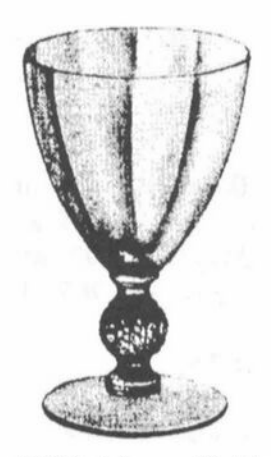
1066 11 oz. Goblet