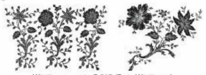
Wildflower and E-517 (Early Wildflower)

Next in the 'Wild' category is the wonderful and well-known Cambridge etching, Wildflower. The earliest reference to this etching is 1935. Wildflower was used on the major lines 3400, 3500 Gadroon, 3600 Martha, Pristine and 3900 Corinth. The etching will also appear on many candleholders, tumblers, various relish dishes and a #3650 bell. An entire book is available on the etching Wildflower. The etching is primarily found on crystal, plain or with gold edge, and will appear on some Amber and Gold Krystol pieces. Though elusive, there are some Cambridge examples in Ebony with gold encrusted Wildflower.