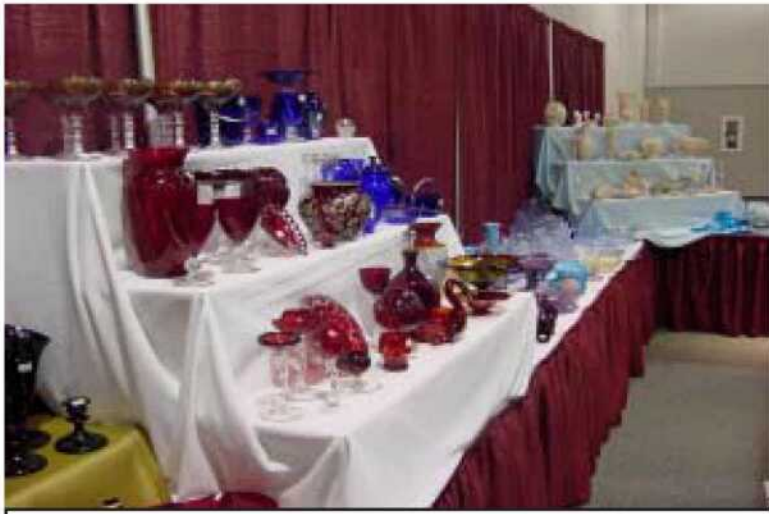
Just a few of the nearly 400 lots of beautiful Cambridge Glass sold at this year's auction. Sales exceeded $53,000 - a new record!

During the day more than 390 lots of Cambridge glassware were sold. There was a wide range of colors and patterns this year. There seemed to be something for everyone. Prices ranged from $5 to $2350 per piece. New collectors had a good chance to start their collections with some of the bargains that could be had. And the advanced collector had an outstanding selection of rare and unusual items to select from this year. Some noteworthy lots (though there were so many it is hard to decide which to mention) that sold were: a very rare #1574 Crystal large Cornucopia Centerpiece, $2350; a rare #3400/ 103 Carmen 6-1/2" Globe vase, Japonica decorated and signed, Aero-optic, $2200; a pair of #1191 Gold Krystol Cherub candlesticks, $1700; a rare #3011/24 Carmen nude mint dish with Crystal stem