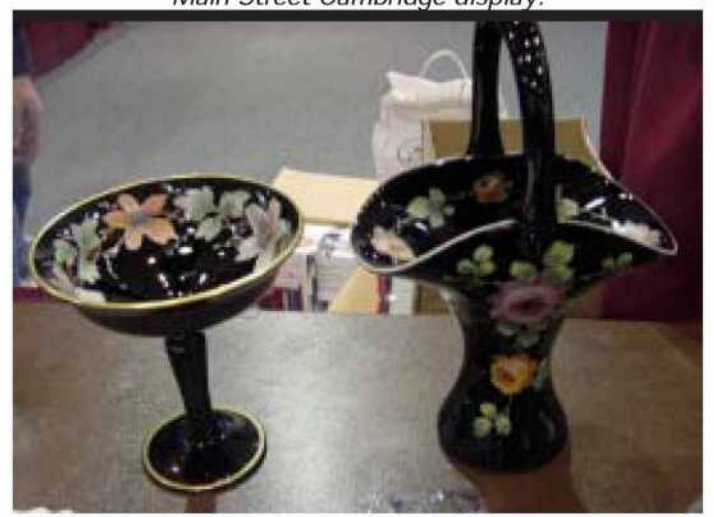
Just two of the pieces displayed at "Bring & Brag" following the March Quarterly Meeting. The comport on the left was decorated by Lotus, while the basket on the right was decorated in house by Cambridge. What beauties!!!