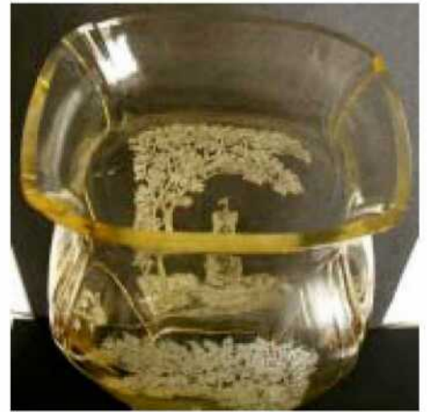
An outstanding Cambridge vase that was submitted to the website for ID; it showed up on ebay a few days later.

Tarzan reports that he gets eight to ten requests in a typical week. Many times, a correspondence develops as pictures and other information go back and forth until the answer is un-