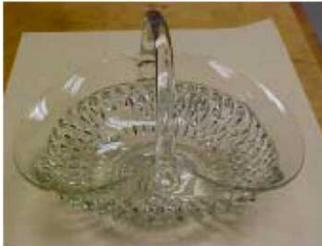
An unusual Mt. Vernon basket submitted for ID