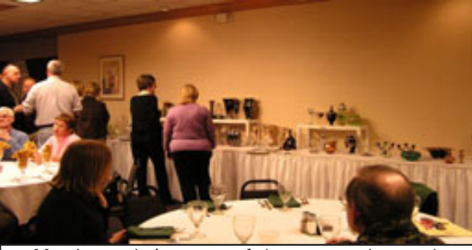
Members admire some of the spectacular overlay pieces on display at the Holiday Inn.

glass. If you look through a crystal piece of glass and white, see actually was etched and the silver was made to adhere to that etch. Lvnn told that this explanation was a simplified very version of what happens because it