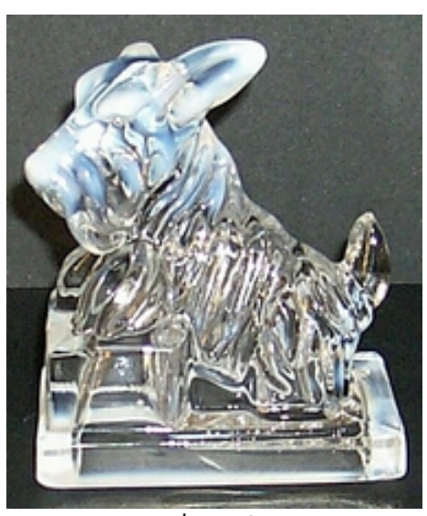
$100/pair Plus $12 shipping & handling; sales tax if applicable.

Send orders to: NCC • PO Box 416 • Cambridge, OH 43725