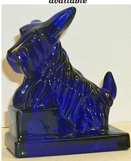
$100/pair Plus $12 shipping & handling; sales tax if applicable.

Supplies are running out fast, order now...limited number available