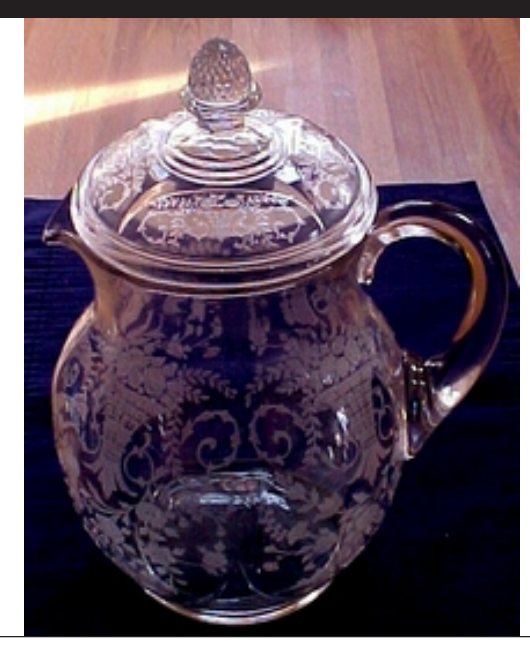
Portia etch 3400/107 pitcher with an Acorn finial lid