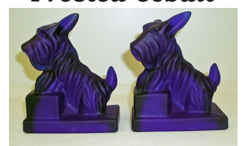
$110/pair Plus $12 shipping & handling; sales tax if applicable.