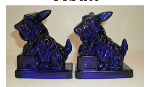
$100/pair Plus $12 shipping & handling; sales tax if applicable.