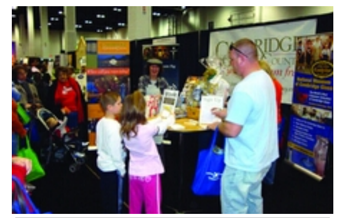
People enjoyed returning to the Cambridge/Guernsey County booth for the hourly drawings. Some even returned several times during the day for the chance to win free admission tickets to area attractions.