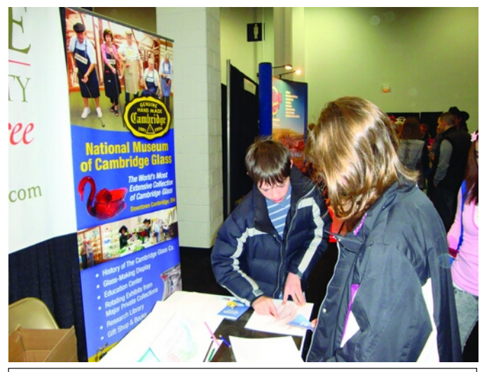
Children enjoyed coming into the booth to do rubbings from Cambridge etching plates. The dragon plate is always popular with the younger crowd.