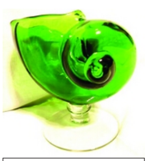
6" Seashell Flower Center