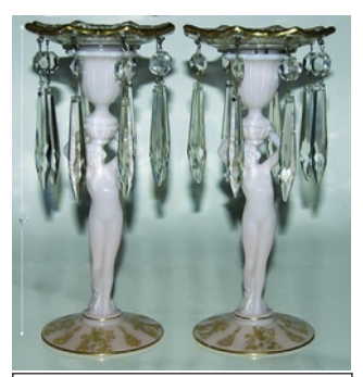
GE Rose Point Crown Tuscan Statuesque candlesticks with bobeches