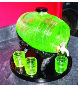
No.1 Keg Set with tray