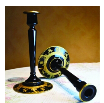
Ebony candlesticks GE Imperial Hunt Scene