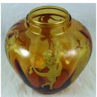
GE Dancing LadiesTemple Jar