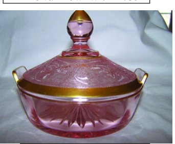
Pink covered butter E520