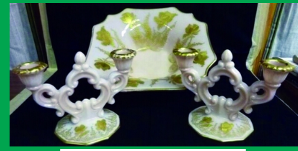
Crown Tuscan console set GE Gloria