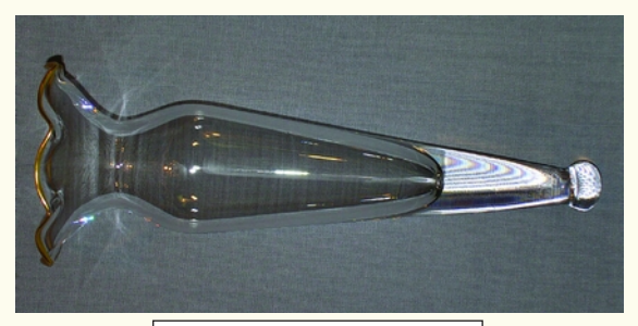
#2355 Vase Cambridge Arms

A unique flower vase was designed for use with Cambridge Arms. The arm vase measures 7" long and should not be used with a traditional epergne. This vase is pictured below.