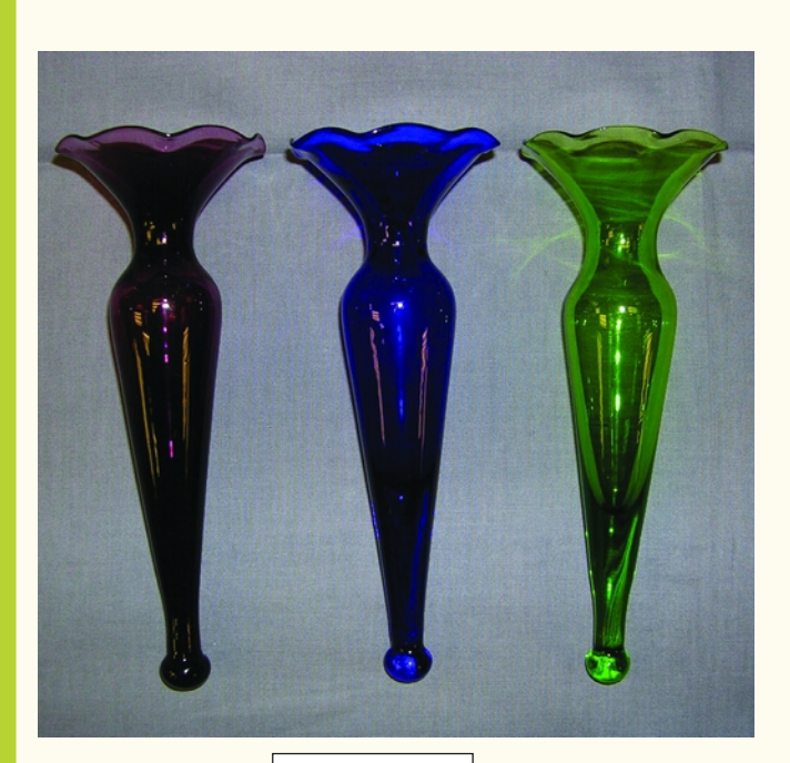
#2355 Vases 6"