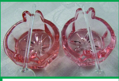
#400 Individual salts with glass spooons