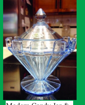
Modern Candy Jar & Cover - Moonlight