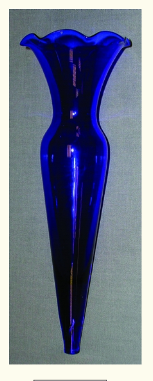
#2355 Vase 8"