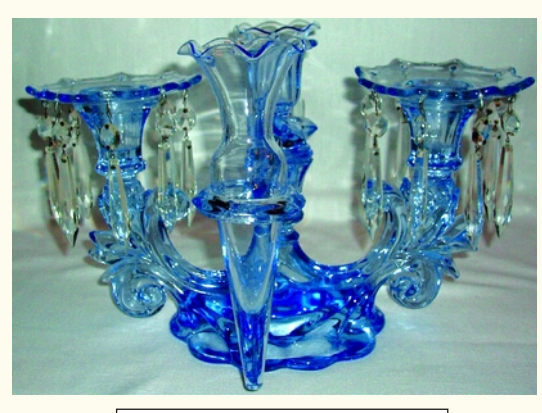
1358/8 Moonlight Blue Epergne

The standard arm used for building an epergne possesses a center candle cup in the shape of a tulip and two rings of glass designed for holding two flower vases. The actual patent shows the arm with the tulip-shaped candle cup as well as sphere of glass. The second version has never been seen. The arm designs for which no patent has been found vary in the design of the center finial. Arm #1433 measures 7 3/4" and possesses a small sphere of glass in the center where the traditional candle cup exists. (production is uncertain) Arm #1434 measures 9" and possesses a faceted finial seen as part of the 1402/80 and 1402/81 epergnes. Arm #1435 measures 10 1/2" and possesses a faceted diamond shaped final and was used with a variety of different epergne. These three different arm variations were produced for a very limited period of time and are extremely difficult to find. It appears the #1433?, #1434, and #1435 arm were only produced in crystal.