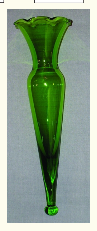
#2355 Vase 8"