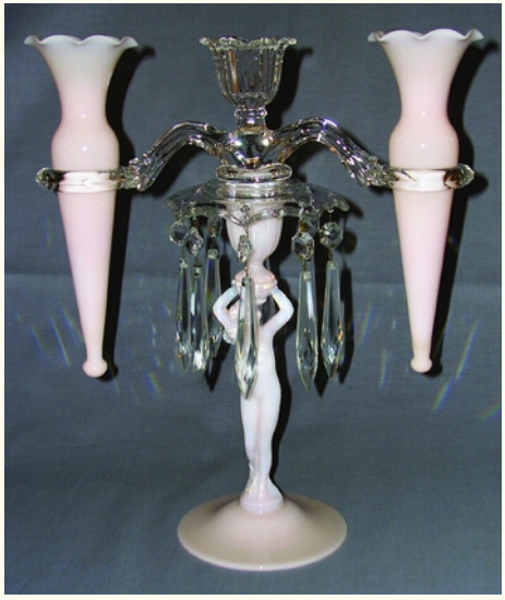
#3011 Crown Tuscan Epergne