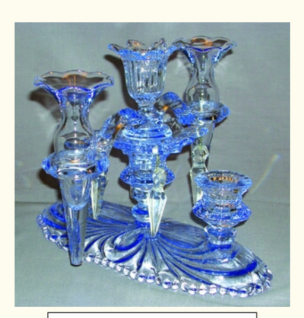
#76 Moonlight Blue Epergne

The majority of epergnes were produced in all crystal, but with the introduction of the Caprice line in 1936, a few epergnes were produced in all Moonlight Blue. These epergnes included the #75, #76, #1357-8, and #1358-8 epergnes. The #1357-8 and #1358-8 epergnes were not officially part of the Caprice line, but Moonlight Blue Caprice collectors graciously welcome these epergnes into their collections. The #75 and #76 epergne requires the 9" #1437 arm while the #1357-8 and #1378-8 epergne requires the 10 ½" #1438 arm. To my knowledge, these are the only two arms ever to be produced in color.