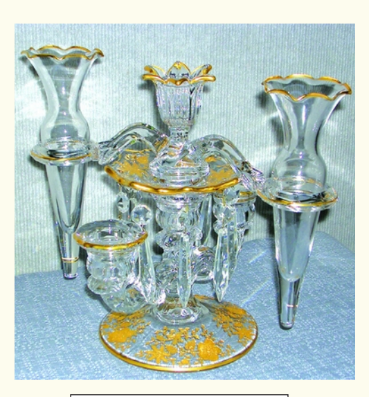
#645 Gold Wildflower Epergne