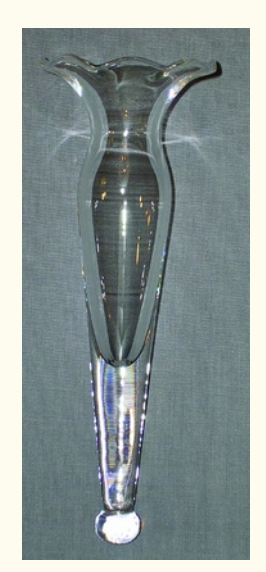
#2355 Vase 6.5"