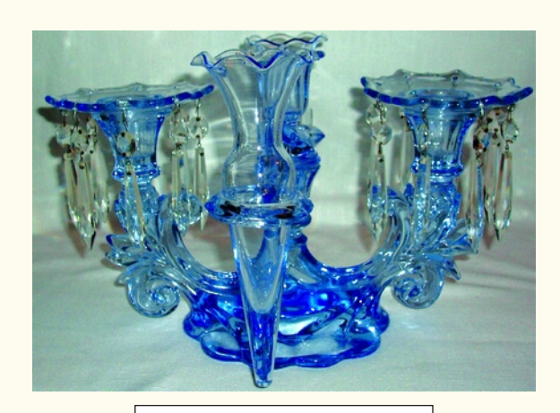
1358/8 Moonlight Blue Epergne

The flower vases that fit the arms were produced in three different sizes. Each of the vases was assigned the item number 2355. There sizes were 6", 6.5", and 8". Arm #1433 and #1436 were designed to accommodate the 6" flower vase. The #1437 arms were designed to accommodate the 6" or 6.5" flower vase. The #1435 and #1438 arms were designed to accommodate the 8" flower vase. The 6" and 8" flower vase can be found with the glass ball removed from the bottom of the vase. The 6" and 8" flower vases can be found in multiple colors: amber, amethyst, forest green, royal blue, and moonlight blue. All the Moonlight Blue flower vases that I have seen have had the ball of glass removed and were used with the Caprice line or as an accessories to the Caprice line. The 8" vase was also produced in Crown Tuscan. These colored 6" and 8" vases were used for a variety of different epergnes, but their production was very limited. Larger and smaller similarly shaped flower vases have been found, but there has been no confirming documentation found linking them to the Cambridge Glass Company. Every documented Cambridge flower vase possesses eight crimps.