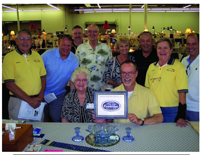
Members of the Heart of America Glass Club show their enthusiasm for Cambridge glass.