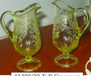
#3400/39 Tall Creamers Appleblossom