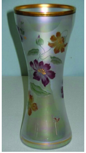
vase with Clematis decoration

An identical vase to the one that appeared in Welker spiral book #2, plate 7, is in Photo 5, and it is the Sinclaire blank #3071 in Pearl with Clematis. The Bennett book (plate 25, page 41) provides photos of three vases that are credited to Cambridge; however, the two vases on the bottom row both were made by Sinclaire in Pearl with Clematis, with the one on the left being Sinclaire blank #3172 (the "cuspidor" - actually a vase - that also appears on the Photo 5 : Sinclaire Pearl cover of the Bennett book) and the one on the right being identical (Sinclaire