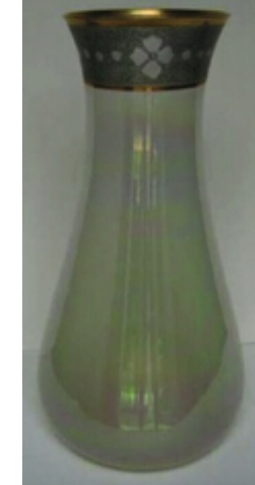
Photo 9: Cambridge 8" vase is blank #2357 with border etching covered in green enamel

discussed during the Bring & Brag session at this year's NCC convention. Although it lacks a floral decoration, it has the pearl treatment and was likely made by Cambridge. The vase in Photo 9 is shown with a close-up of the border etching in Photo 10 and, indeed, the border etching is identical to the one that appears on the vase in Photo 8.