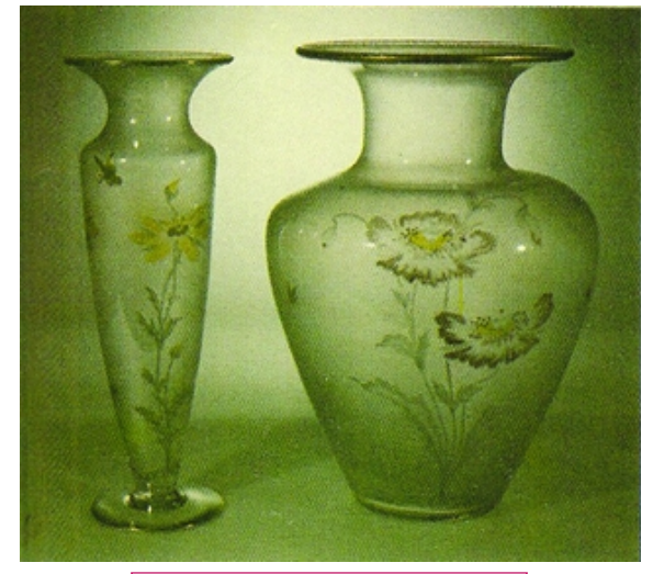
Photo 3: Sinclaire Pearl vases in photo reproduced from Farrar, Volume II, 1975