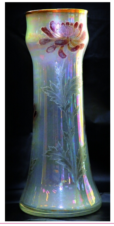
Photo 11: Cambridge 10" vase is blank #2367 with floral decoration

Finally, the tallest vase of the three in the Museum is in Photo 11, and this vase is the 10" Cambridge blank #2367. It lacks a border etching but, in all other respects, seems to fit the features of Cambridge production. The floral decoration could be mums.