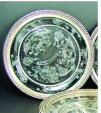
#691 Canapé plates with Wallace Sterling edges