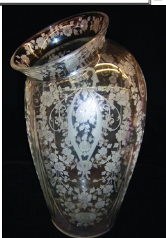
#3400/134 - Crystal 13" Vase, Etched Diane