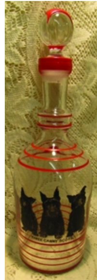
1323 - 28 oz. Decanter with D/985 Three Canny Scotts décor