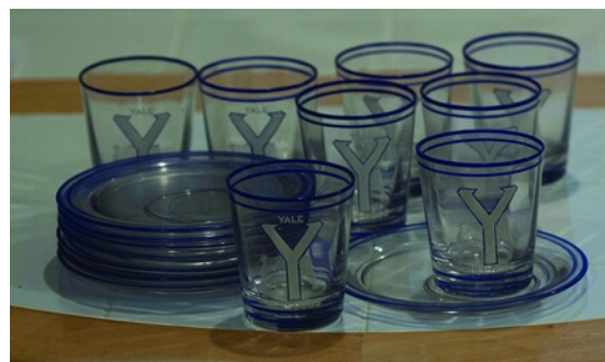
No. 320 - 7 oz. Old Fashioned Cocktails with 8 canapé plates