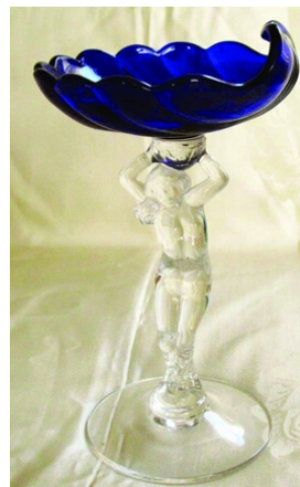
3011/29 - 4" Mint