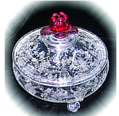
No. 300 - 6" 3-toed Candy Box and Cover, with a Carmen Rose Knob