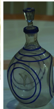
1070 - 36 oz. Pinch Decanter, Stopper Shape 2