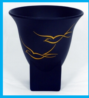
Ebon 3797/91 - 5½" Belled Vase, D/1 Birds