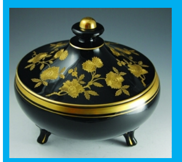
300 - 7" 3-toed Candy Box and Cover, D/1059 Gold Encrusted Blossom Time