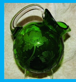
400/38 - 80 oz. Ball Shaped Jug, E Gloria