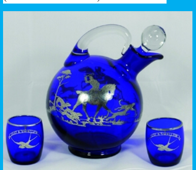
#3400/92 - Royal Blue 32 oz. Ball Shaped Decanter, Silver Hunt Scene Décor & 21/2 oz Tumblers (2) w/ Silver "Just a Swallow"