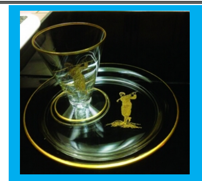
693/3000 - 2-piece Canapé Set, Enamel Encrusted Golfer with Gold Trim

This report is provided to keep members up with what's happening on the world's largest Internet Auction site. It is not meant as an educational tool, nor as a pricing guide, and we cannot guarantee the accuracy of listings herein.