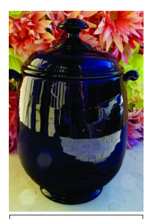
Royal Blue #1402/87 covered Cookie or Pretzel Jar