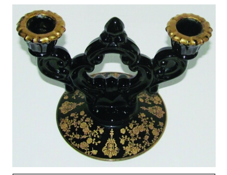
3400/647 - 6" 2-lite candlestick Ebony and Gold Encrusted Rose Point

This report is provided to keep members up with what's happening on the world's largest Internet Auction site. It is not meant as an educational tool, nor as a pricing guide, and we cannot guarantee the accuracy of listings herein.