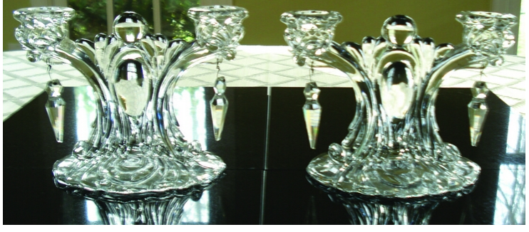
Crystal Caprice 69 - 7½" 2-lite Candelabrum, #5 Prisms (Version 3)