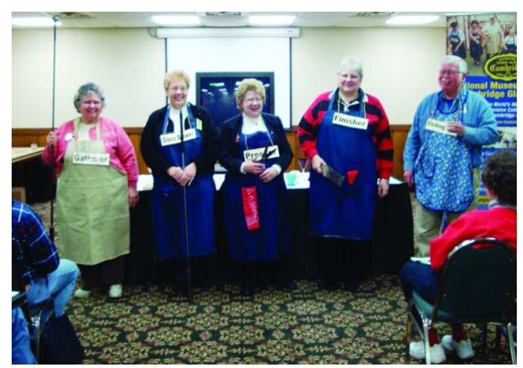
At the conclusion of our program about Cambridge Glass during the State Lions Club Convention at Salt Fork Lodge, members of the audience were invited to dress as glassworkers and demonstrate the process of making fine handmade glassware. They were a very interested group!