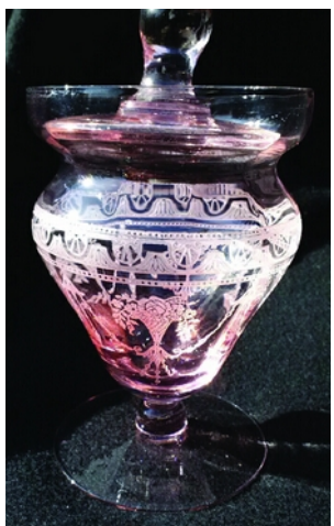
57 - 7 oz. Footed Marmalade and Cover E 701