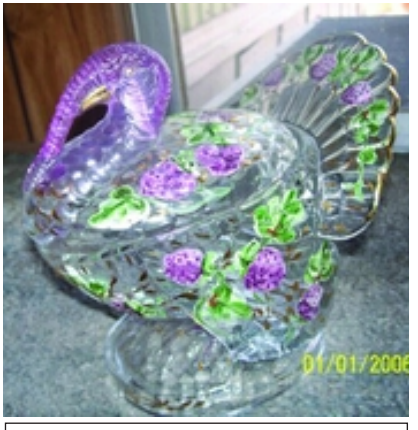
1222 Turkey with hand painted decor