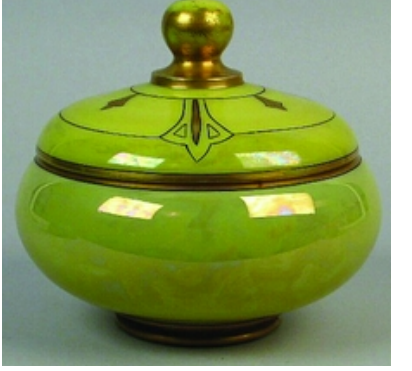
Flashed Primrose No. 102 - 6' Bonbon and Cover