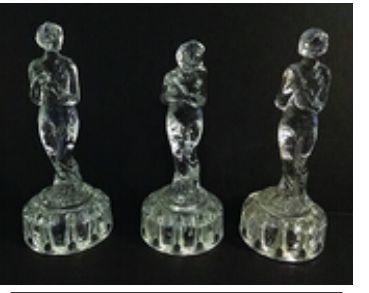
#508 - Crystal 9" Mandolin Lady Figure Flower Holders