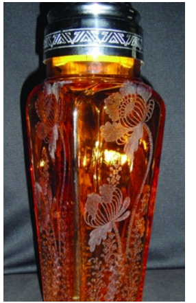
E Gloria 3400/158 - Cocktail Shaker