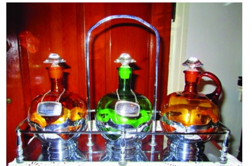
Farber liquor set with three 3400/113 – 38 oz. decanters