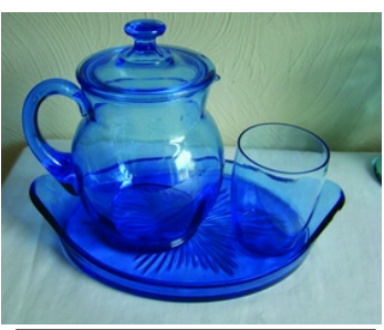
#488 – Ritz Blue 4 piece Night Set