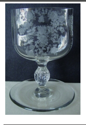
1066 - oval cigarette holder with ash tray foot Rose Point