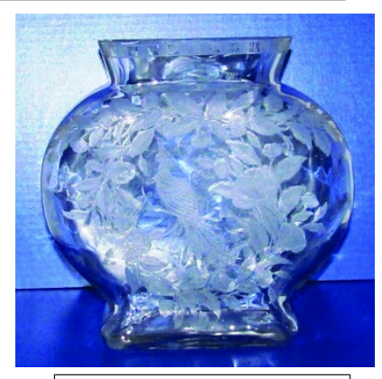
1002 - 1½ Gallon Aquarium, E736