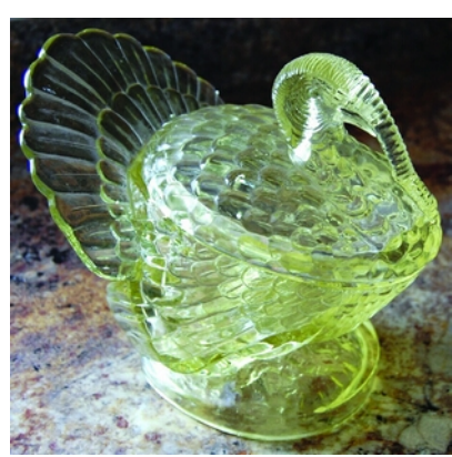
Gold Krystol turkey