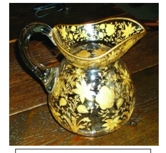
GE Wildflower 3400/141 – 76 oz. Jug