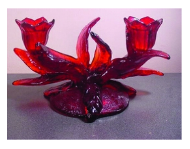
Everglade #3 two-lite candelabrum