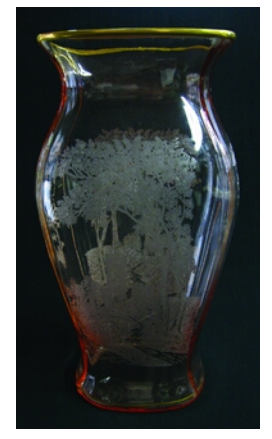
3400/17 – 12" vase with the rarely seen Windsor (Castle) etch