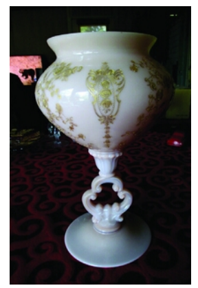
GE Rose Point Crown Tuscan 1305 10 <sup>1</sup>/<sub>2</sub>" globe vase with keyhole stem