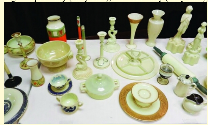
and the Two-Kid. Each of these also was also produced as figurines without the flower-holder base.

Martha Washington". Also, the dolphin candlesticks with Mt. Vernon bases were produced in Ivory, as were 4 types of the flower holders (frogs) – the small Draped Lady, the large Draped Lady (early base), the Rose Lady (early base),