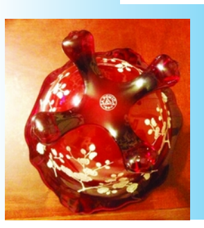
Carmen Japonica 3400/9 7" candy box, upside down showing Japonica stamp