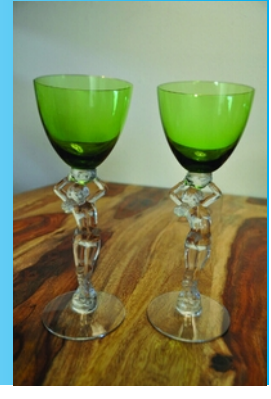
3011/7 Forest Green 4 ½ oz clarets