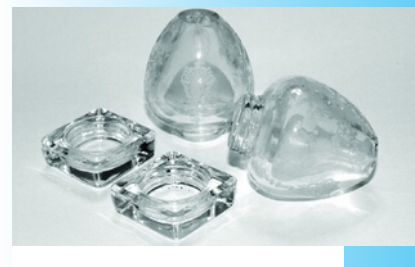
1468 egg shaped salt and pepper with square glass screw-on base