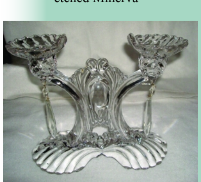
Caprice #69 2 lite Candelabrum with shell bobeches