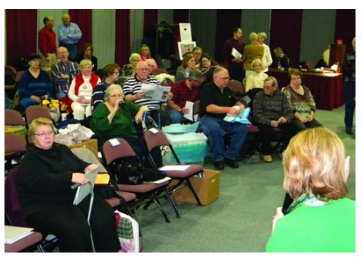
People enjoying the March auction

The committee needs to strictly observe all dates mentioned as we only have a few short weeks to properly inspect, identify, and have a completed auction catalog prepared for the day of the auction. We would like to thank all consignors in advance for their timeliness and adherence to these procedures.