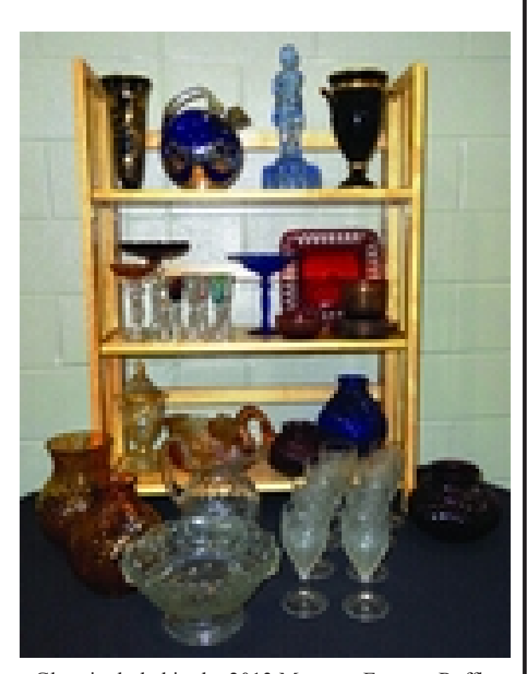
Glass included in the 2013 Museum Forever Raffle.