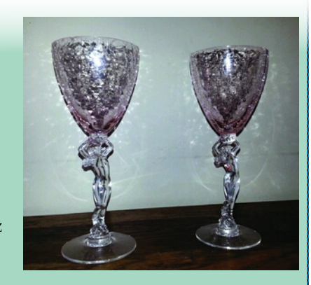
Pink crackle table goblets