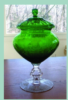
1304 Forest Green Gloria 11" covered urn