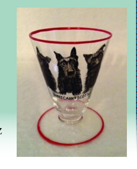
Three Canny Scots 3 oz Canape tumbler