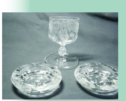
1066 cigarette and 387 ash trays etched Minerva