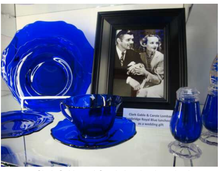
Clark Gable and Carole Lombard received a Cambridge Royal Blue and Crystal luncheon set as a wedding gift in 1939.