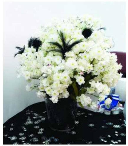
An ice bucket can hold flowers