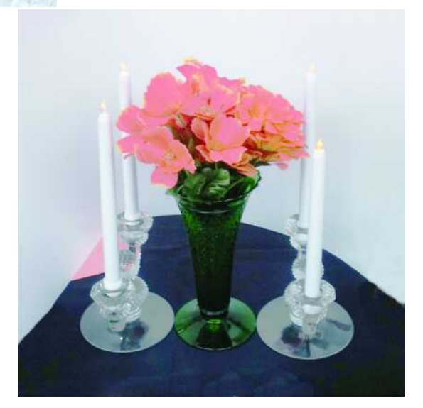
The Mt Vernon double candle holder can be seen in "Blue Bloods"!