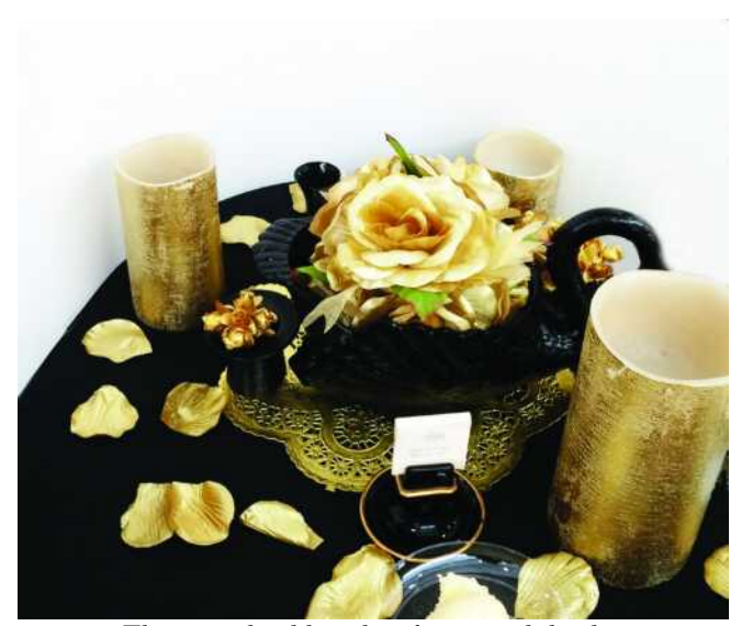
Ebony and gold makes for a regal display