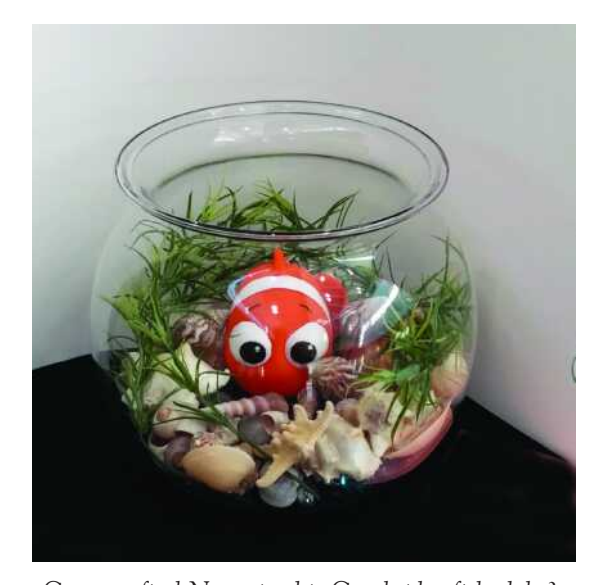
Can you find Nemo in this Cambridge fish globe? (Hint: check your 1903 catalog)