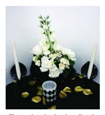
Elegant ebony bowl and candlesticks