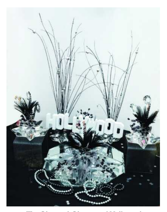
The Glitz and Glamour of Hollywood