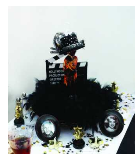
This amber lady is dressed for Hollywood