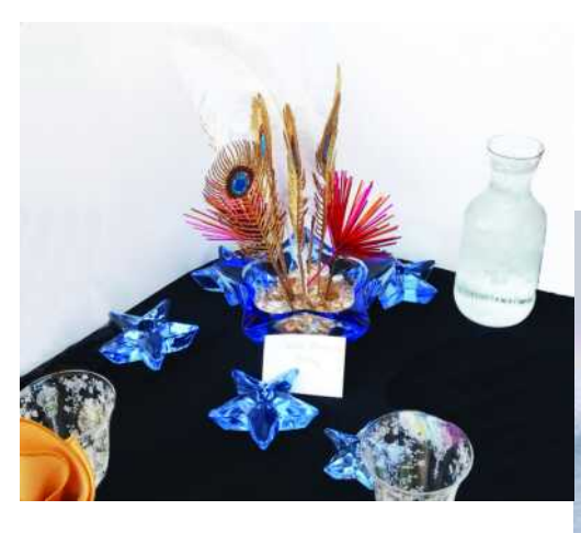
Hollywood loves stars!