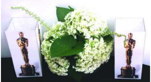
Hollywood loves Oscar