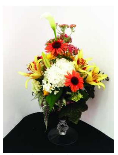
Flowers are the "key"