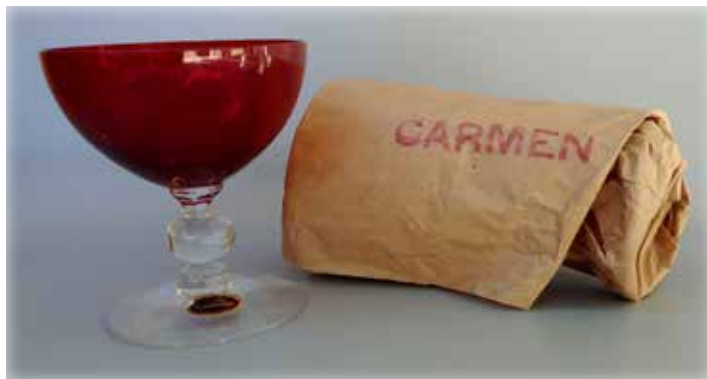
3103 Carmen Sherbet and 9 oz goblet in original factory wrapping