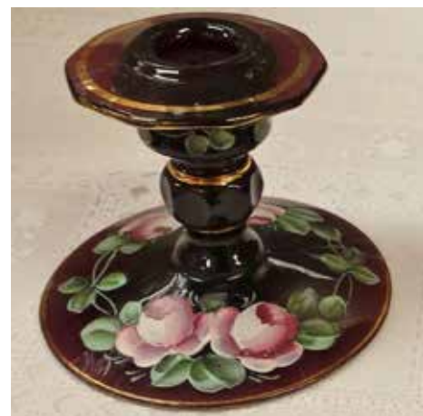
Version 1, Amethyst, Charleton Decor