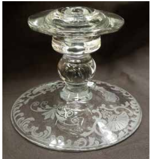
Version 3, Etched Firenze