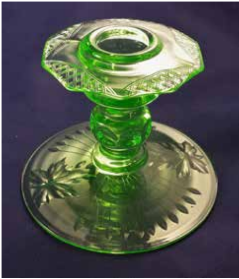
Version 1, Light Emerald, RCE 657