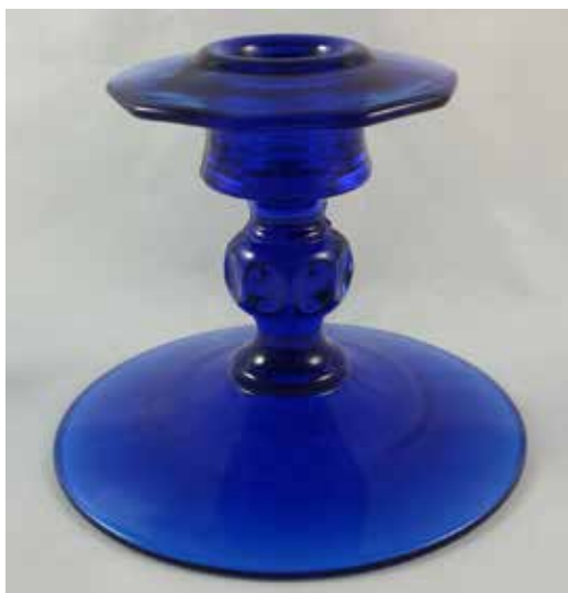
Version 1, Ritz Blue