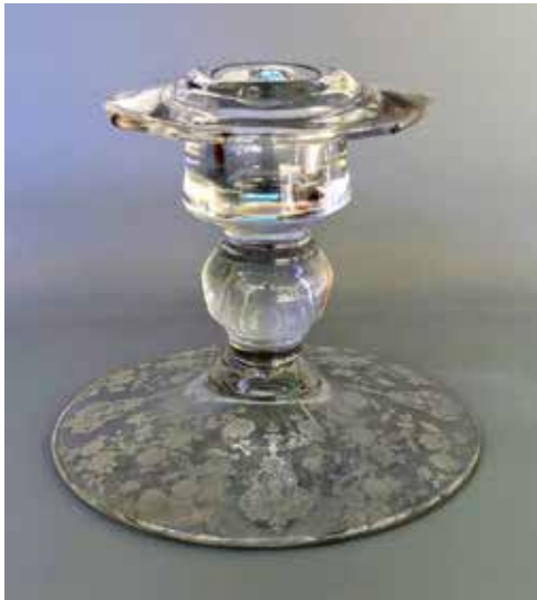
Version 3, Etched Rose Point