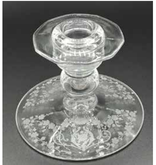
Version 3, Etched Diane