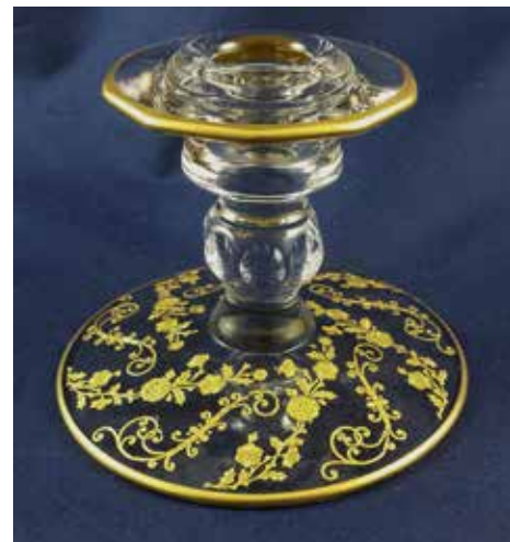
Version 1, Etched Elaine, Gold Encrusted

Final thought for you collectors: The colors and etches listed above as available were taken from the Cambridge price lists and circular letters and are all known to exist. The vast majority of the #627 blanks found are Version 1. Those listed above in Versions 2, 3 & 4 as well as others you may have or yet to be discovered should be considered difficult to find. And lastly, of all the items listed as available RCE, I only know of #541, #639 (not listed as available) and #657 as well as some that are unidentified. Given that they were listed as available in all these other patterns, you'd think some exist or would show up. So any examples RCE must also be considered hard to find. ■