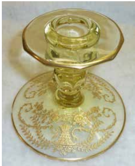
Version 1, Gold Krystol, Etched Portia, Gold Enc.