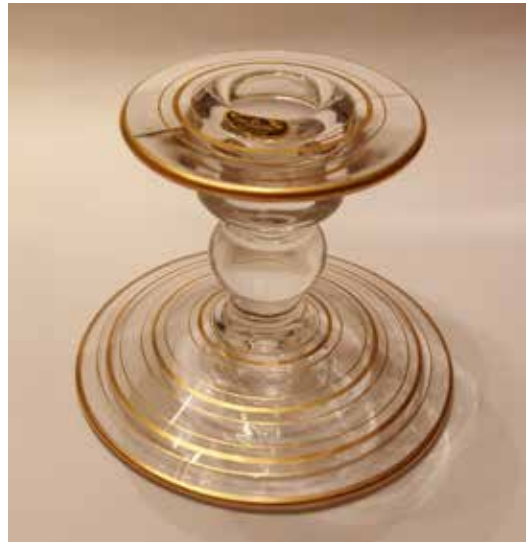
Version 4, D/1046 Gold Bands