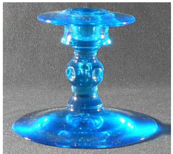
Version 2, Bluebell