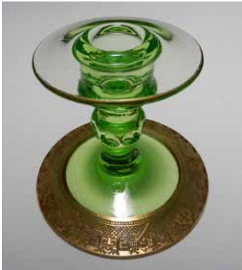
Version 2, Light Emerald, Etched Willow, Gold Band Overlay