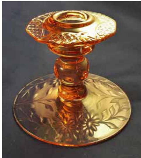
Version 1, Peach-Blo, RCE Unknown